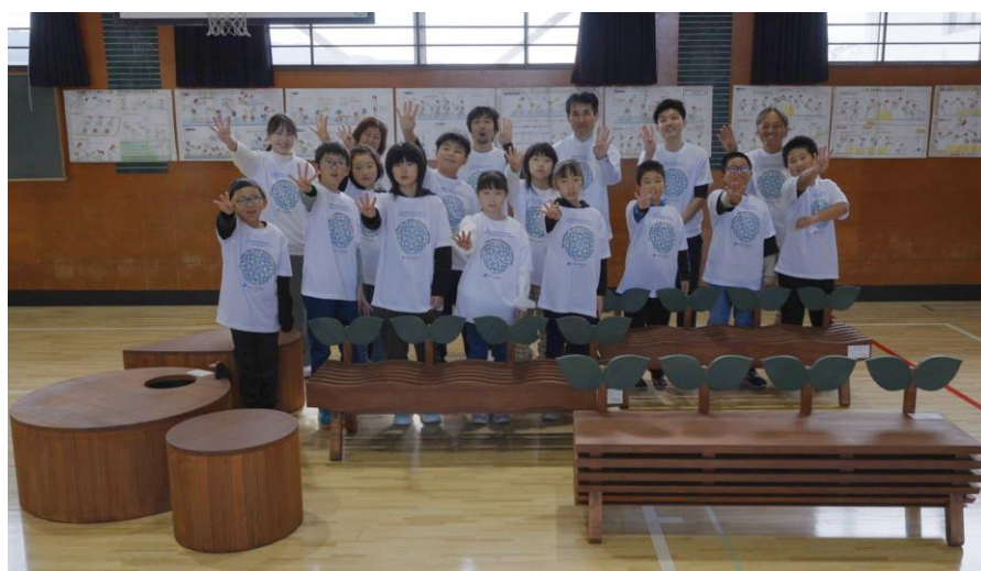
October 2023: Everyone from Fujisato Municipal School with the completed benches